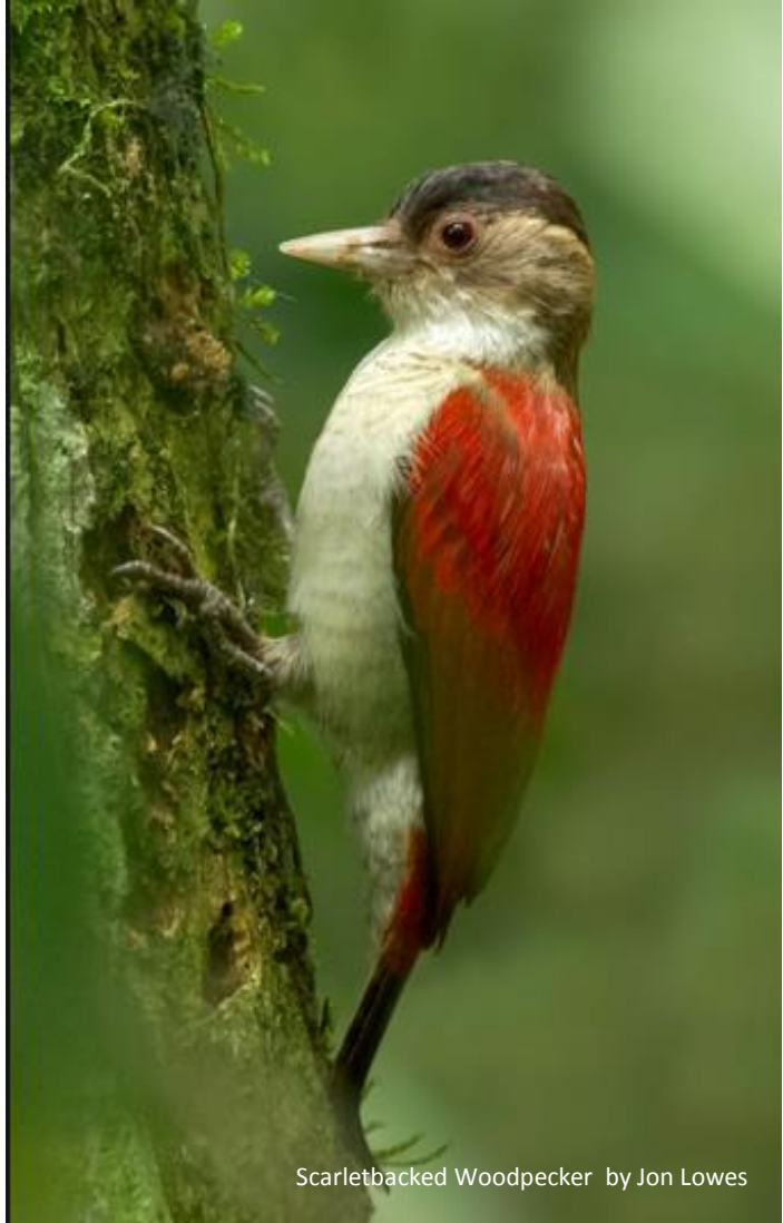
Scarletbacked Woodpecker by Jon Lowes