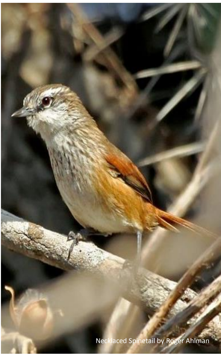
Necklaced Spinetail