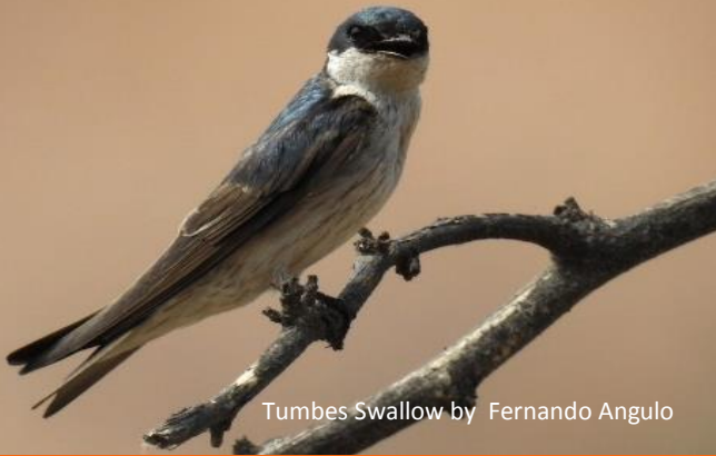
Tumbes Swallow