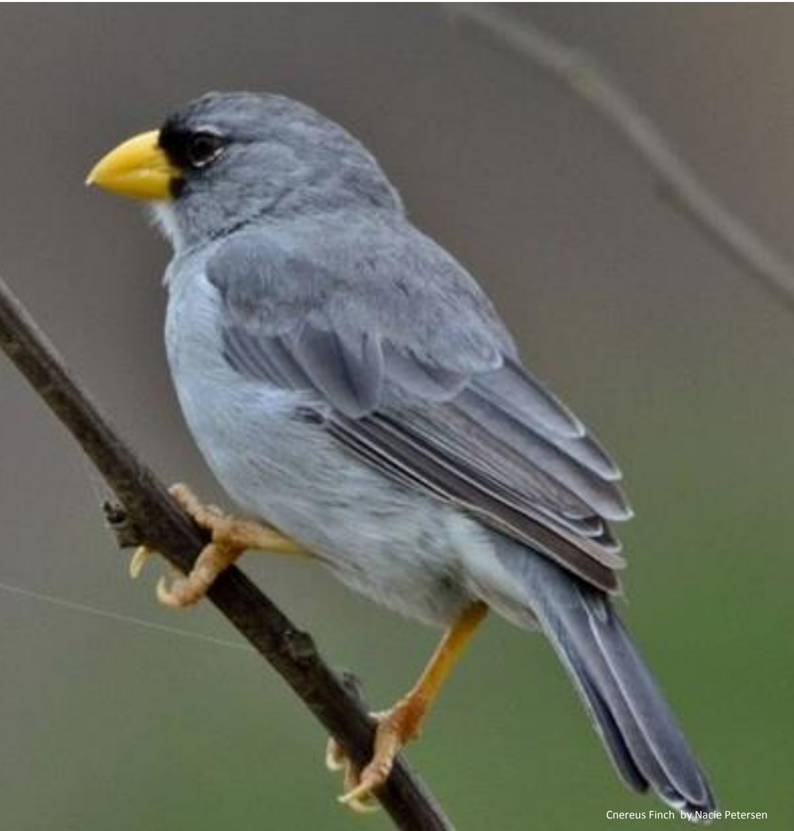
Cnereus Finch by Nacie Petersen