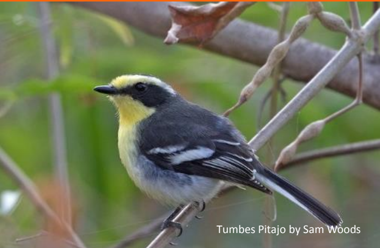
Tumbes Pitajo