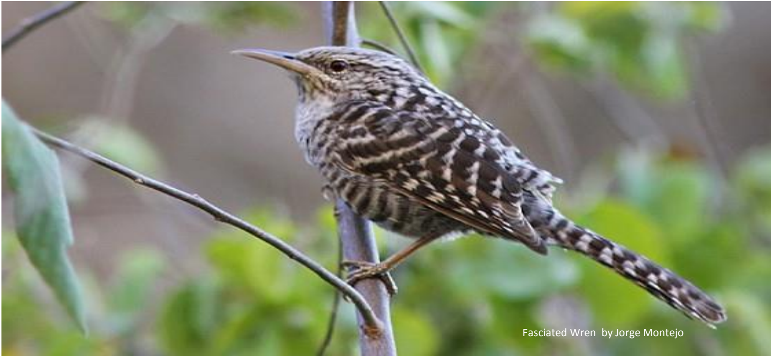
Fasciated Wren