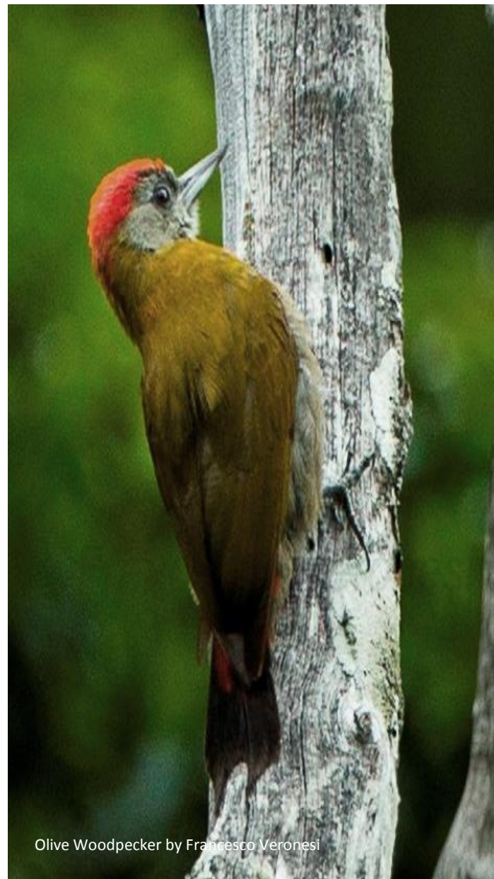
Olive Woodpecker by Francesco Veronesi

Pick up from hotel and transfer to airport for flight to Lima. Suggested Flight LA2273, 08: 30-09: 45.